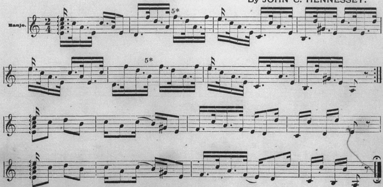
Annie's Dream Mazurka.